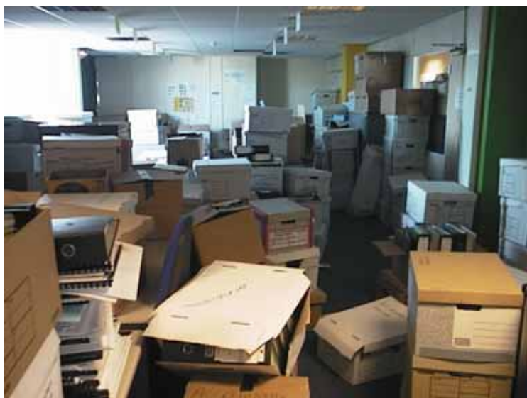
Figure 1 Data Management – before! 1

Around 140 attended the Petroleum Exploration Society of Great Britain's Data Management 2003 conference. About 25 oil company personnel attended – a rather high percentage compared to the major trade shows – suggesting that data management remains a concern. Unfortunately, no oil company folks presented papers – leaving the field wide open to rather too many vendor 'infomercials'. Many of these centered on the use of geographical information systems (GIS) to manage and use upstream data. Records management was also highlighted – with presentations on the need for systematic records management policies. Conwy Valley presented a new standards initiative in petrography. Technology-wise, insightful new presentations came from Landmark on seismic transcription, and on well deviation data acquisition and processing QC from Hydro Systems. On the governmental front it was ' Groundhog Day ' all over again – with yet more initiatives to preserve the Nation's data and keep the oil flowing.