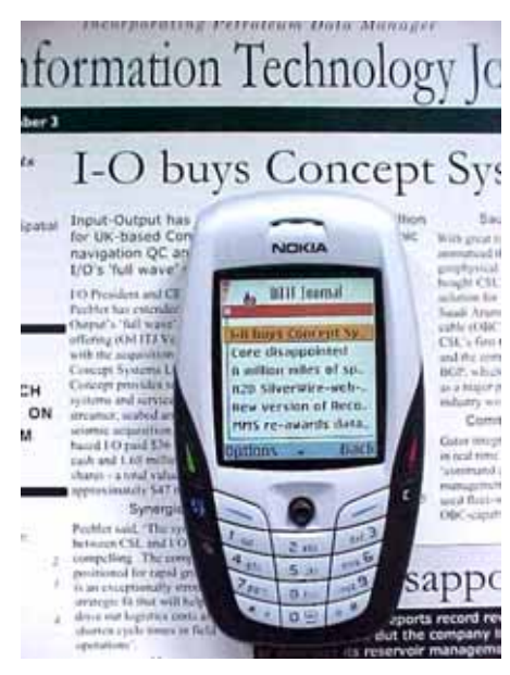
Figure 2 Read RSS feed on your SmartPhone<sup>5</sup>.

This is simple, standards-based publish and subscribe. Oil IT Journal receives several hundred hits per day from RSS robots – overkill for a monthly publication!