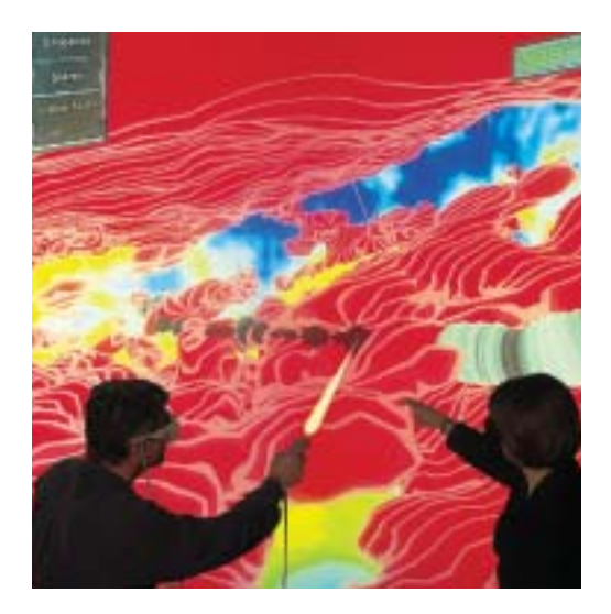
Working within a virtual world allows users to better understand data relationships and encourages collaboration and decision making.